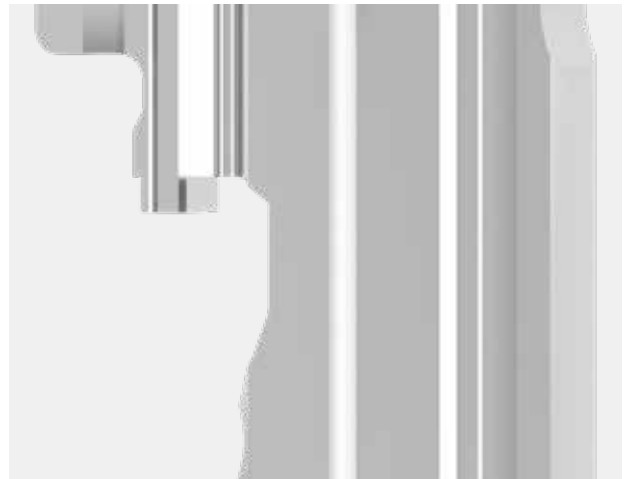
The Zolit locking system is fitted with the patented Intop system* in both the cylinder and the key to provide effective protection against illegal key copies and manipulation of the lock cylinder.