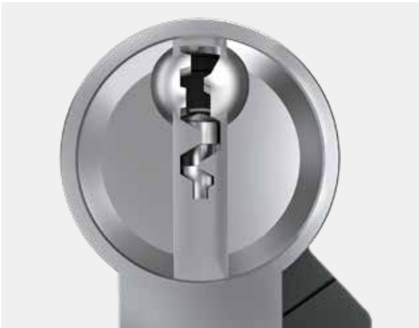
The Zolit conventional locking system with vertical key insertion opens the door conveniently.