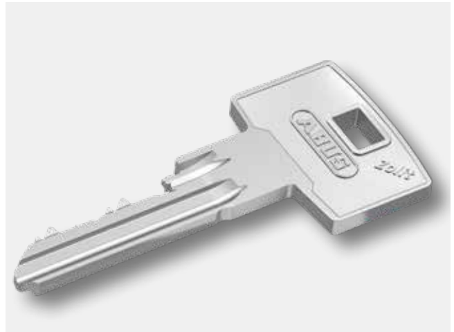
The high-quality, stable key is made from low-wear nickel silver to ensure long-term security.